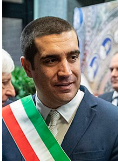
Michele De Pascale , Mayor of Ravenna, Italy